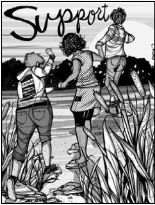
Art by Cristy C. Road, croadcore.org

Community-based responses to violence have a long history in many of our communities and networks, and have often been developed in contexts where we could not rely on the state or larger community to protect us from violence (such as Black communities in the slavery and post-slavery eras, immigrant communities, queer communities, and Indigenous communities). But these practices may not necessarily be called “community accountability” and can look very different depending on the circumstances.