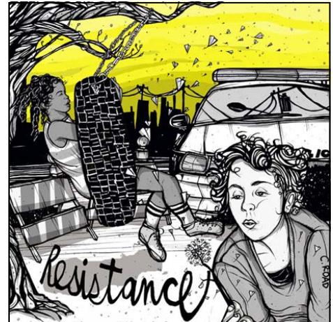
Art by Cristy C. Road, croadcore.org

Ask yourselves and your allies how you can work to better document and address law enforcement violence against women of color and trans people of color and build for safer communities as part of your organizing!