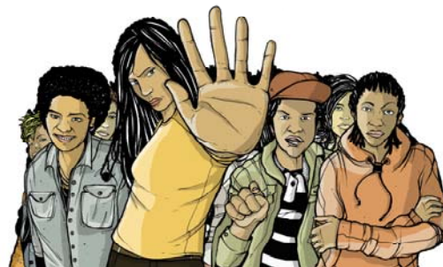
Art by Cristy C. Road, croadcore.org

To support women of color and trans people of color survivors of police brutality, as well as individuals and groups who are working to raise awareness of and fight police brutality against women and trans people of color, we wanted to bring together as much information as possible, as well as resources and organizing tools and ideas developed by groups across the country, in one place. It is intended as an educational resource for activists and organizers, and provides some examples of organizing tools and strategies.