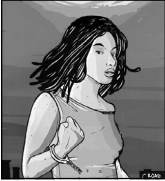
Art by Cristy C. Road, croadcore.org

Native peoples' experiences are often completely erased from mainstream discussions of law enforcement violence. Yet, since the arrival of the first colonists on this continent, Native women and Native Two Spirit, transgender and gender nonconforming people have been subjected to untold violence at the hands of U.S. military forces, as well as local, state and federal law enforcement. 1 Movement of Native peoples across borders with Canada and Mexico has been severely restricted, often by force, separating families and communities. 2 Integral to the imposition of colonial society and enforced assimilation, the notion of “policing” was forced on sovereign nations and cultures that had previously resolved disputes within communities. 3