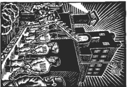
Drawing by Matt Waehler, www.waehler.com

Today, there are many progressive and radical arms of the anti-violence movement, primarily led by women of color, that are actively challenging our partnership with the criminal system. Though we will continue to prioritize the safety of survivors and our communities, we will not let ourselves be co-opted.