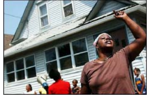
A protest in Rochester to bring attention to the case of a 13 year old Black girl shot by police responding to a request for assistance because the girl was suicidal.

People have also been successful in organizing around specific cases as a way to raise awareness of law enforcement violence against women of color and trans people of color more generally. For instance, FIERCE! and Bay Area New Jersey 4 Solidarity have organized around the case of the New Jersey 4, a group of women who were subjected to misogynist, homophobic and transphobic violence and then arrested, prosecuted, and sentenced to long prison terms. For more information, see the Left Turn Article about the New Jersey 4 reprinted in this toolkit.