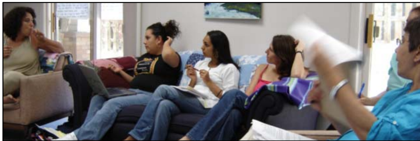
Meeting at a Colorado anti-violence agency to talk about how to resist and organize around arrests of domestic violence survivors under mandatory arrest policies.

For more information and ideas, check out the materials on organizing for community accountability in this toolkit!