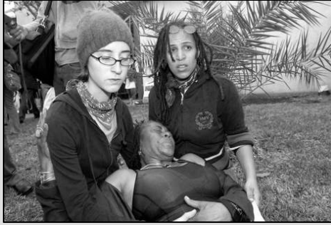
INCITE! New Orleans member (right) and another activist support a woman hurt by police in a demonstration for affordable housing

During a December 2007 protest at New Orleans City Hall to save 4,500 units of public housing scheduled to be demolished in a city facing a severe housing crisis for returning residents -- particularly low-income residents of color -- police unleashed Tasers, pepper spray, and batons on public housing residents and their allies seeking to speak at a City Council meeting at which the demolitions were to be approved. New Orleans public housing residents are overwhelmingly African American women and women headed households, as were those targeted for police abuse at the demonstration. INCITE! New Orleans members, some of whom were present at the protest, emphasize that denial of safe affordable housing to poor and working class women of color is an act of violence and it also increases vulnerability to domestic and sexual violence, and poverty. The destruction of public housing in New Orleans is also a population control issue, an act of racial cleansing and reproductive violence. 10