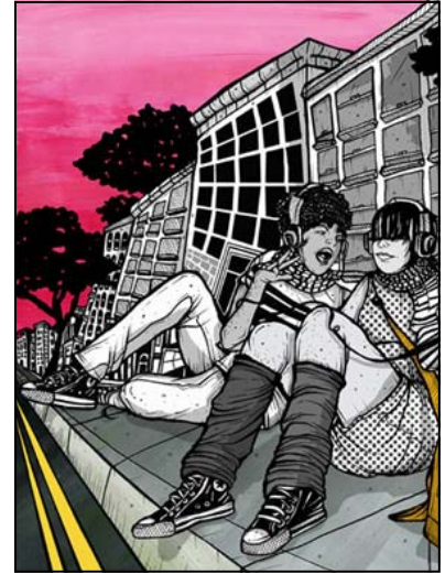
Graphic by Cristy C. Road, croadcore.org

PAR is not so much a set of procedures to follow to gather information as it is a philosophy and approach to gathering and using information. It is also a way to build and strengthen communities and our understandings of ourselves, each other, and our relationships. It can be a powerful outreach, basebuilding and organizing tool to help bring people together to build movements for change.