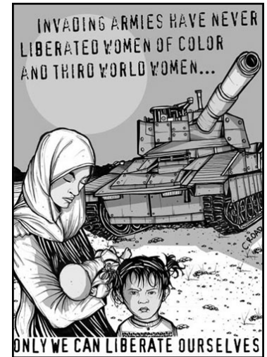
Art by Cristy C. Road, croadcore.org

As military and domestic police forces work ever closer together in a hyper-militarized world, women, children and trans folks of color — both here and abroad — are increasingly subjected to law enforcement violence that shares many characteristics, forms, tactics, targets, language and even personnel with the US and other military forces. 2